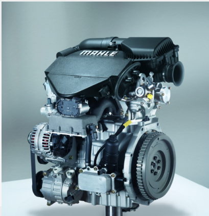
>> MAHLE downsizing engine

The general principle of engine downsizing is based on replacing the current engine in a vehicle with another of smaller capacity but with equivalent performance. This approach is most relevant for large or medium-sized vehicles where the potential fuel economy and emissions benefits can be maximised.